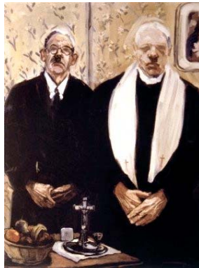
Priest and Undertaker